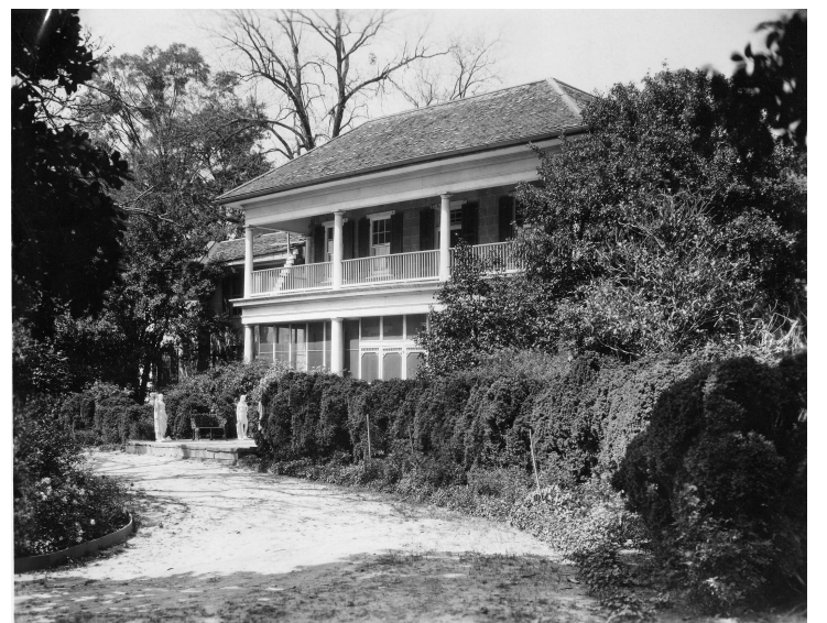
Magnolia Vale before it was destroyed by fire in 1946. The current house occupies the footprint of the older house and was designed by Koch and Wilson of New Orleans. This view includes a small portion of the elaborate Brown's Gardens, which were well known to river travelers.