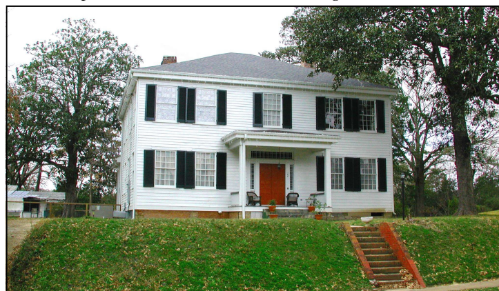
The Thomas Ellis House at 166 Homochitto Street

southern rear elevation. Between 1892 and 1897, while owned by wholesale grocers Rumble and Wensel, the two sections of the building were united