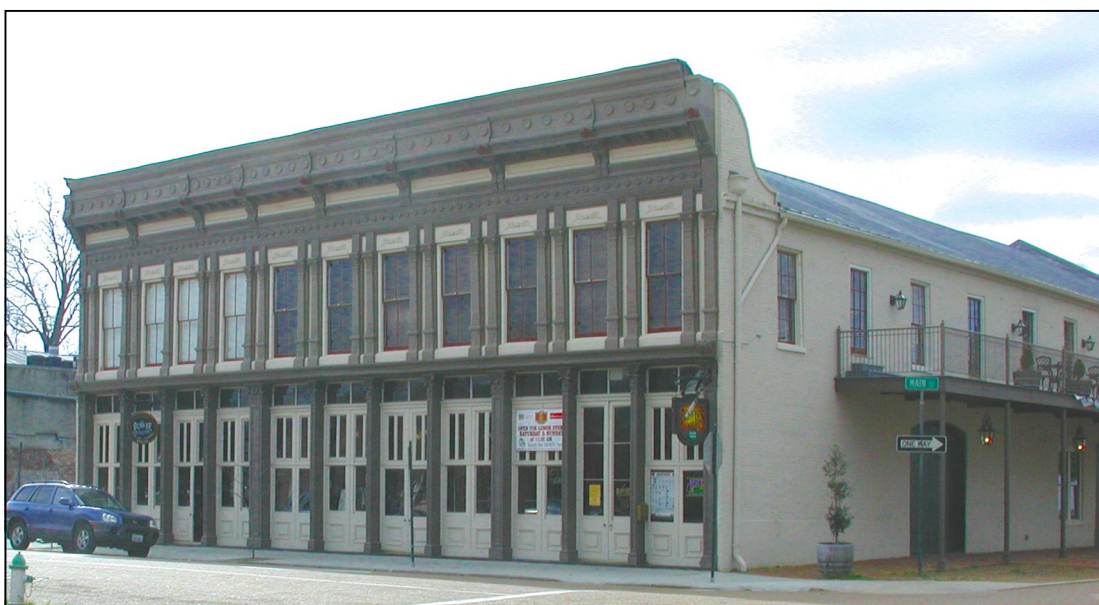
The Henderson cotton warehouse and later Rumble and Wensel wholesale grocers at 100 Main Street, now home to Bowie's Tavern and luxury bed and breakfast accommodations

P. O. Box 1761, Natchez, Mississippi 39121