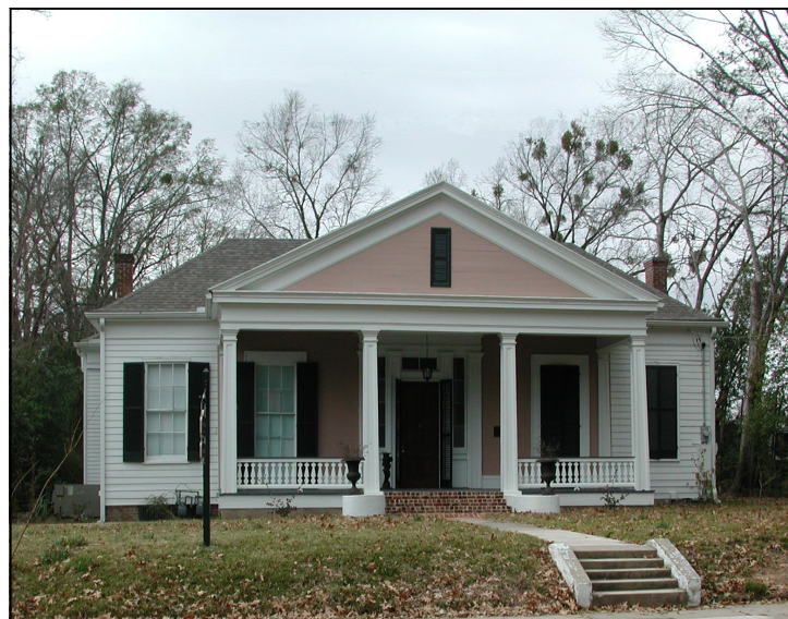
The Joseph Stone House at 804 Washington Street